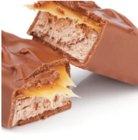
CHOCOLATE BAR INCLUSIONS